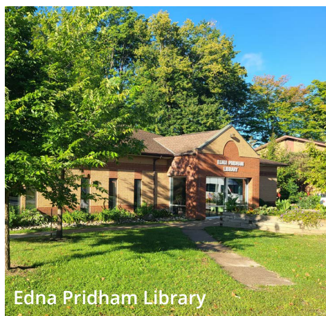
Edna Pridham Library