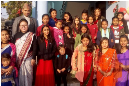
Our Partner Church Christmas Celebration, Nepal

"Sovereign Lord, as you have promised, you may now dismiss your servant in peace. For my eyes have seen your salvation, which you have prepared in the sight of all nations: a light for revelation to the Gentiles, and the glory of your people Israel." (Luke 2:29-32)